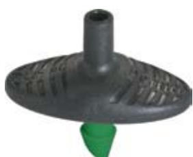
Pinch Drip™ PC 2 gph Barb 0.16"