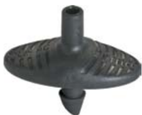
Pinch Drip™ PC 1 gph Barb 0.16"

* C v for all Pinch Drip™ emitters conforms to ISO 9261