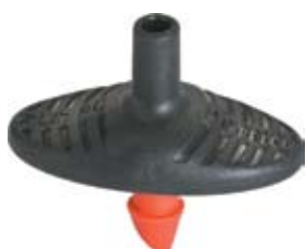
Pinch Drip™ PC 1/2 gph Barb 0.16"

Pots, patios and landscape applications.